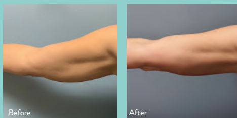
Dr. D. Kiba

For patients wanting to turn back the hands of time without any further disruptions to their daily activities, EvolveX treatments are ideal - there is no surgery, no anesthesia, no scars, and no downtime. You can return to your regular routine immediately after these total body procedures.